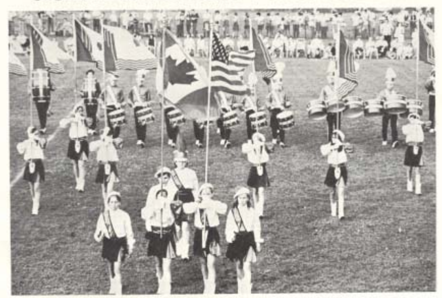
SCARBOROUGH PRINCEMEN DRUM AND BUGLE CORPS

Scarborough Princemen, the proud young Corps that distinguished itself during their first year of competition as an "A" Corps, are eagerly anticipating an even more successful season in 1972. If you are one of those people who do not yet recognize the name of "The Princemen", let me hasten to point out that they are the same Corps that for the past ten years competed under the name of "Scarborough Firefighters".