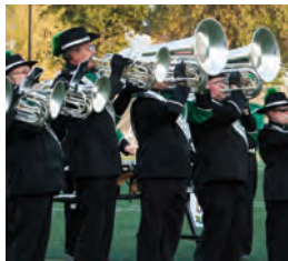
Simcoe United Alumni.