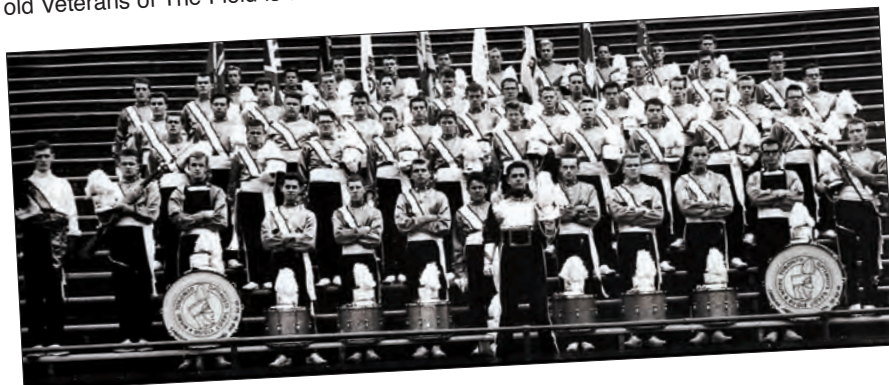
1962, Varsity Stadium, Toronto