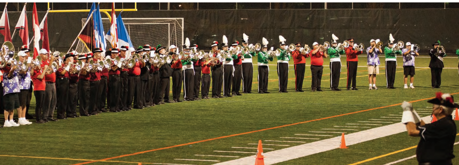
Massed brass at The Legends IV show in Oshawa (previous page and above), hosted by The Optimists Alumni Drum & Bugle Corps on August 25.