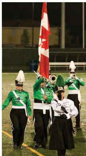
Optimists Alumni National Colours.