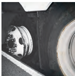
A picture from our "No tire" page of the repair manual.