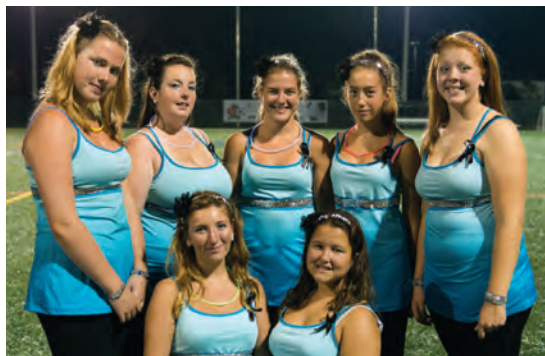
The Optimists Alumni Legends IV Show in Oshawa.