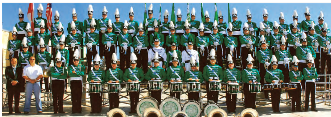
2007 formal photo at The Alumni Spectacular in Rochester, New York.