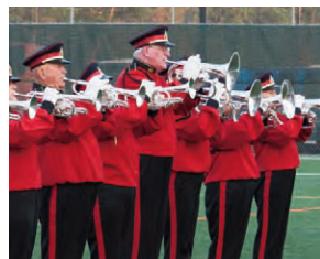
Toronto Signals Band.