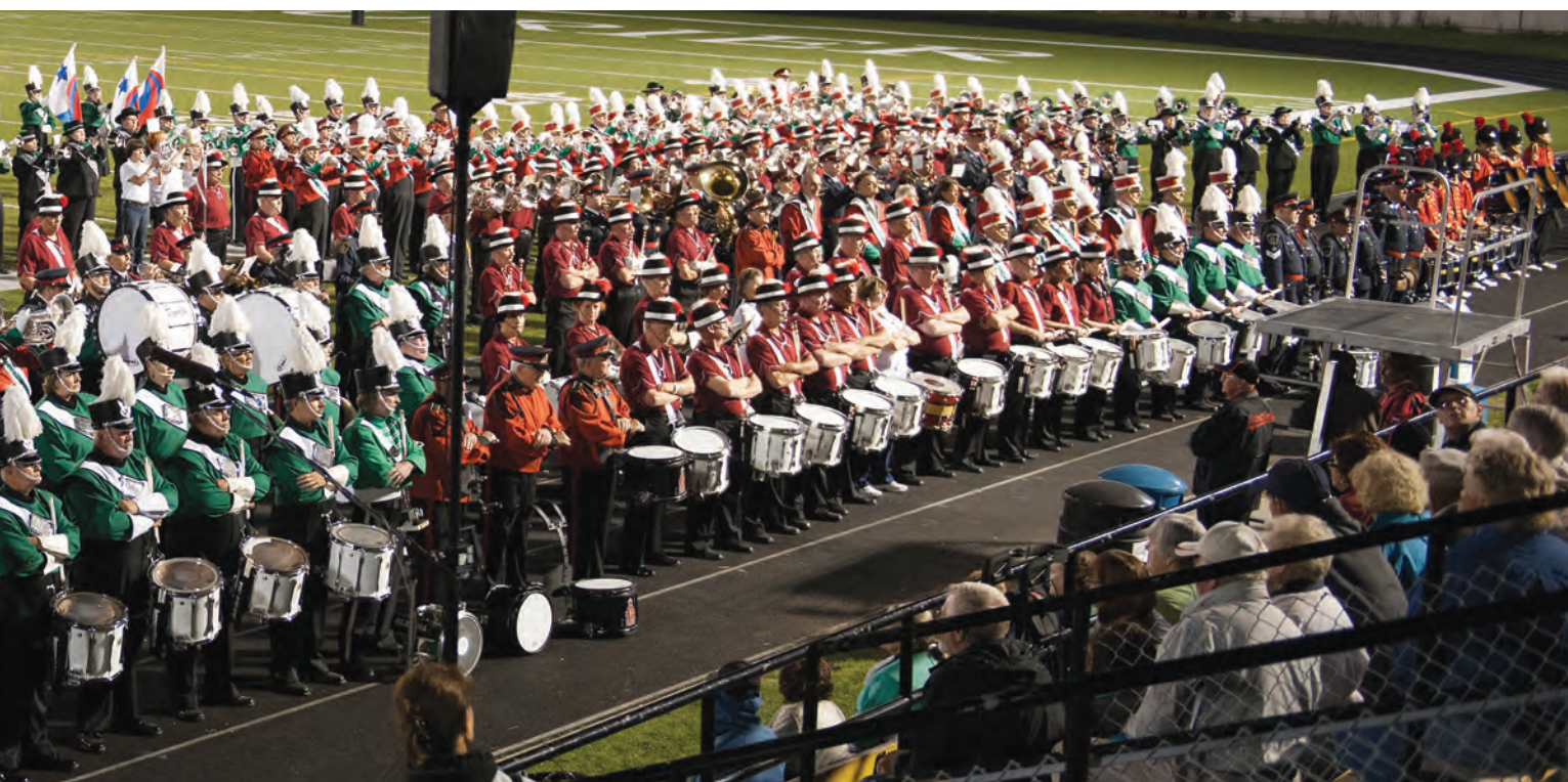
The largest gathering of massed bands in 2012 that The Optimists Alumni participated in, was at The Scout House Invitational Tattoo in Kitchener, Ontario, August 18 (previous page and above).