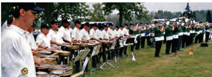
The first performance of the Alumni Corps at a reunion picnic in September 2003.