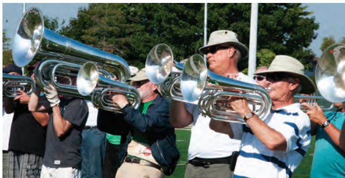
40° Celsius heat didn't stop us from rehearsing. Thunderstorm do.

While it was great to watch the DCI level of drum corps and appreciate Dada, it was equally rewarding to watch our own