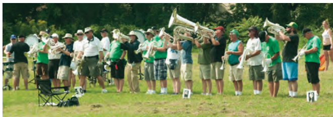
It cooled down to 93°, so it was much more comfortable.