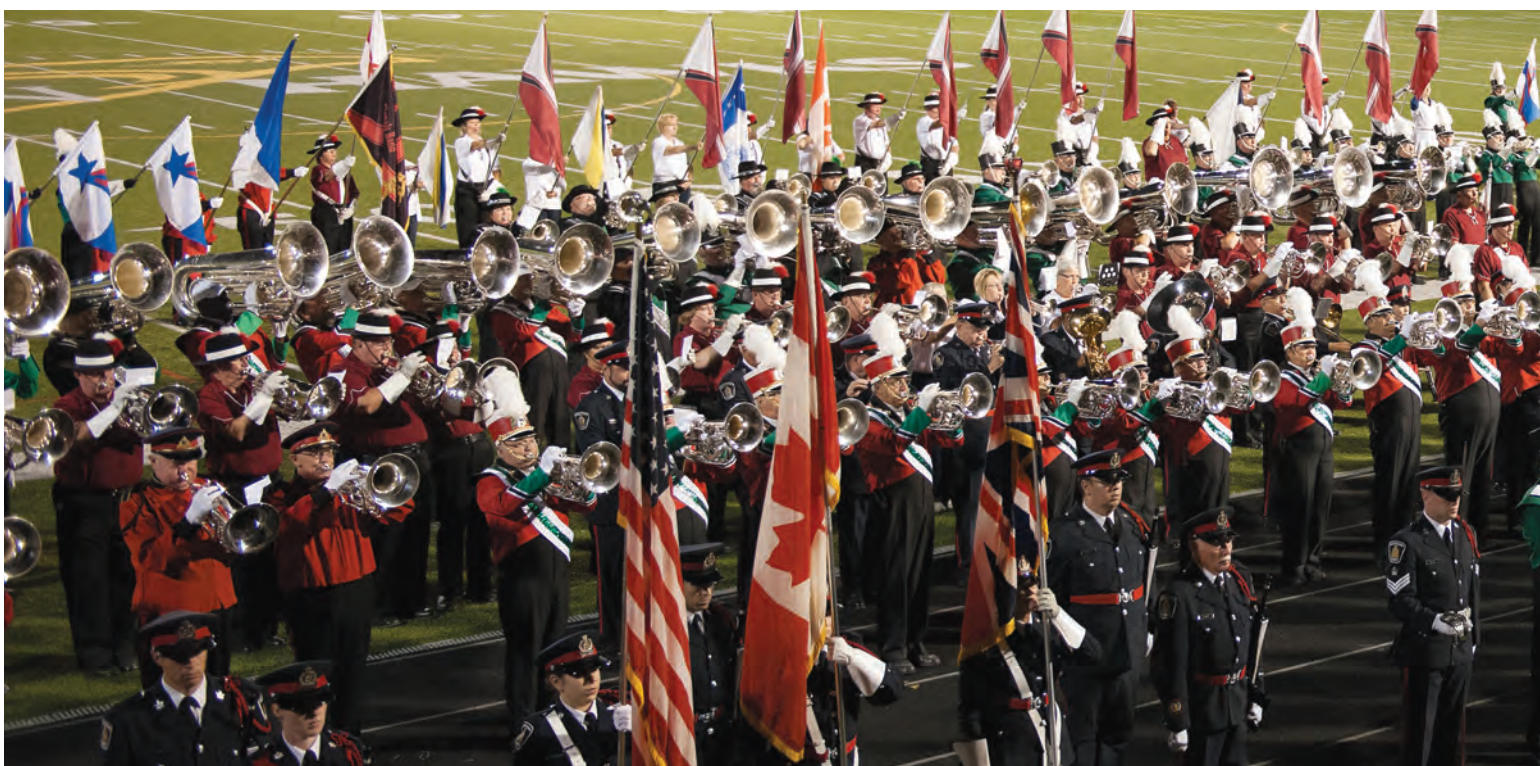
The largest gathering of massed bands in 2012 that The Optimists Alumni participated in, was at The Scout House Invitational Tattoo in Kitchener, Ontario, August 18, (above and next page).