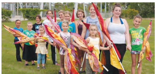
The Northstar Colours (back row) with some junior members watching and learning how to perform.