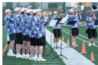
London Midlanders Alumni.