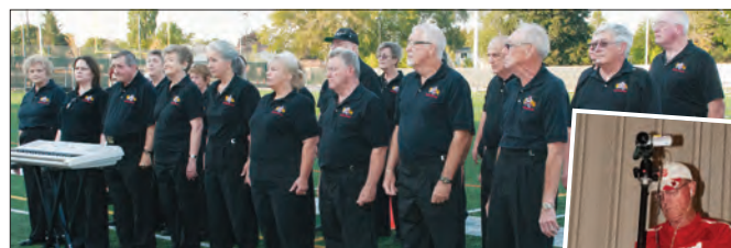
The DCAT (Drum Corps Alumni Toronto) Chorus opened the show with wonderful harmonies including a rousing rendition of The William Tell Overture.