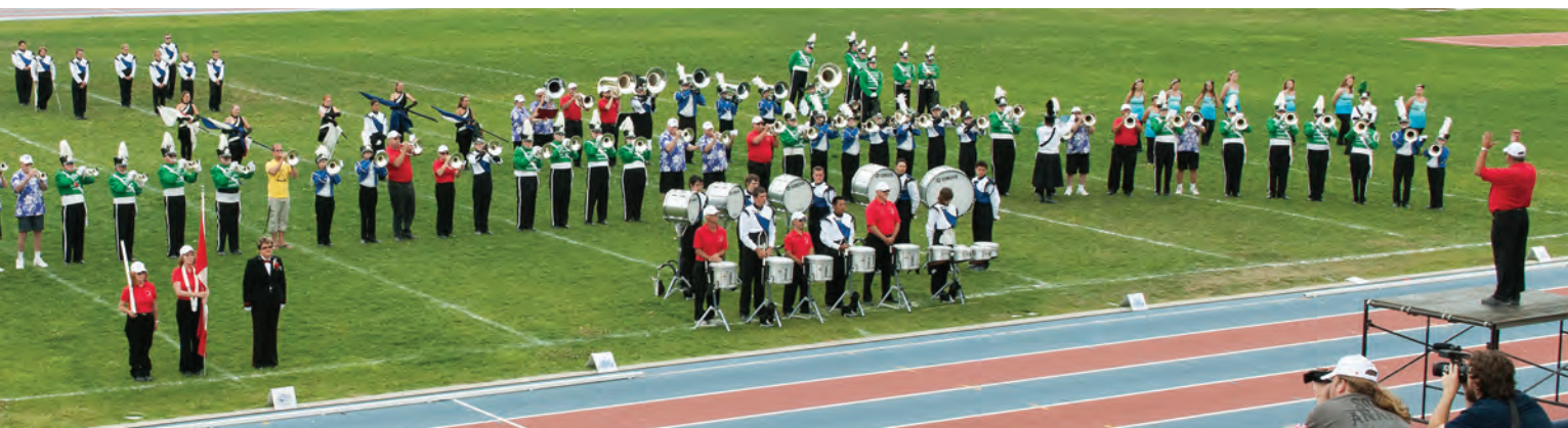
Massed bands at The Yamaha Spectacle of Sound show in Sudbury, (previous page and above) hosted by The Blue Saints Drum & Bugle Corps, July 21.