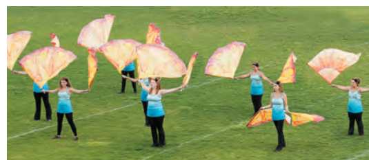
The Yamaha Spectacle of Sound in Sudbury.