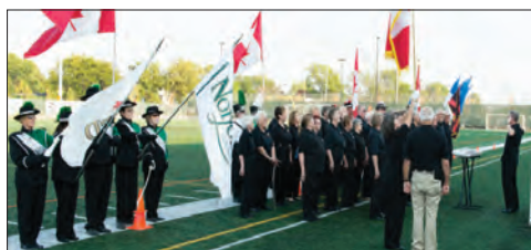
Opening ceremonies, Presentation of the Colours and the singing of O Canada.