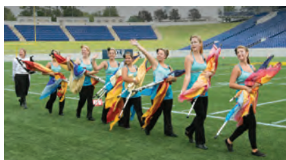
DCA Alumni Spectacular in Annapolis Maryland.