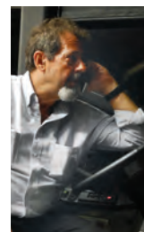
Yes, double pepperoni".