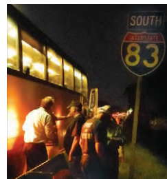
"I think if we all lift this side we'll get the new tire on".