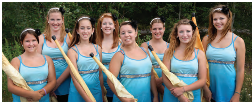
The Yamaha Spectacle of Sound in Sudbury.