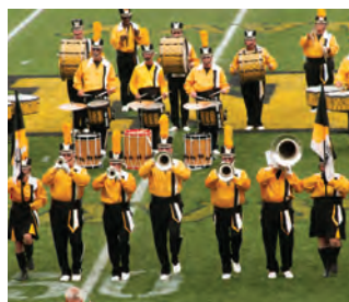
Blessed Sacrement Golden Knights.