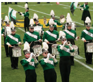
Mighty St. Joe's Alumni.