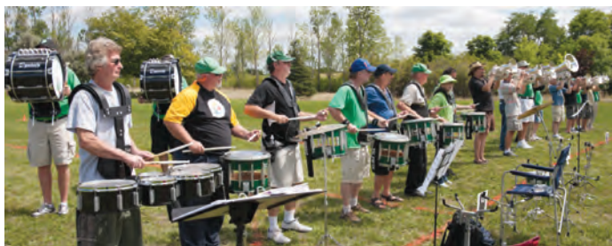
Afternoon practice in preparation for the evening performance.