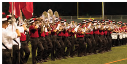
Preston Scout House Alumni.