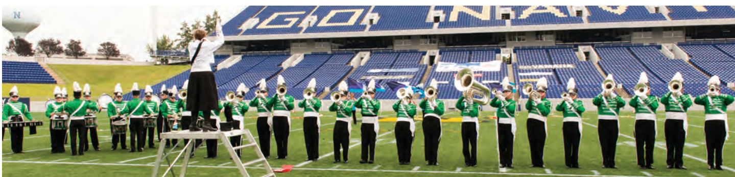
The Optimists Alumni Drum & Bugle Corps.