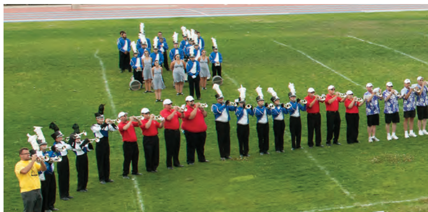
Massed bands at The Yamaha Spectacle of Sound show in Sudbury, hosted by The Blue Saints Drum & Bugle Corps, July 21. (above and next page).