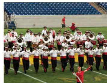
Hawthorne Caballeros Alumni.