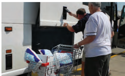
"Don't worry, we'll just make room?"