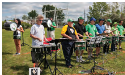
Drum line practicing in Kitchener with storm clouds on the horizon.