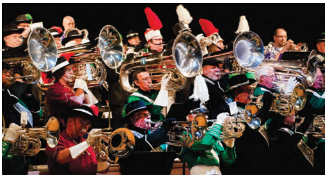
Massed brass playing You'll Never Walk Alone at Simcoe, Ontario.

Four performances so far this year has concluded with massed brass assemblies playing a thrilling rendition of a classic tune. The first performance in 2012 was at the annual United Alumni Drum & Bugle Corps And The Bands Played On 8 show held in Simcoe on May 12, pictured below.