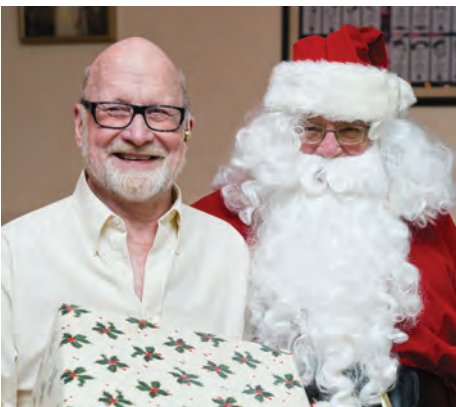
"For me? Such a big gift Santa."