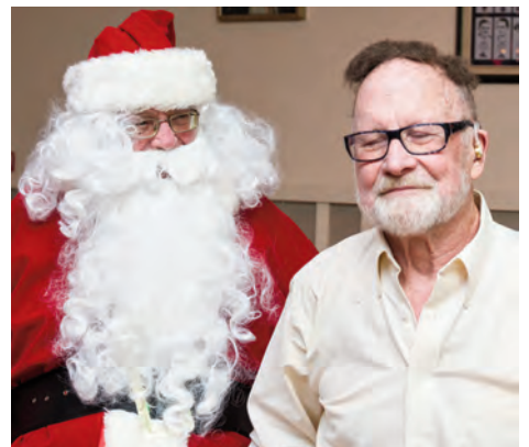
"Gee thanks Santa. You have such discriminating taste"