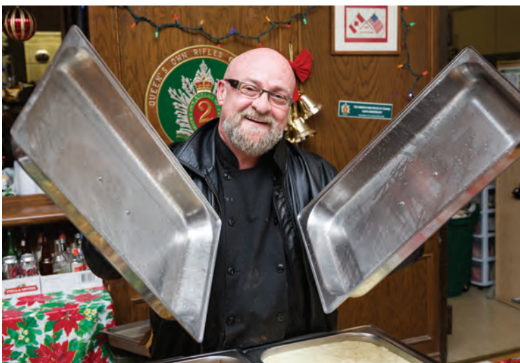
With the traditional "Clanging Of The Tray Lids"... dinner is served. Yes we we did suggest that he consider joining the cymbal line.