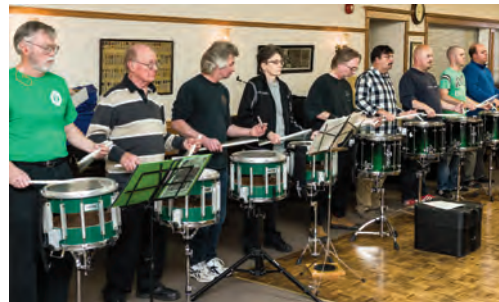
The drumline continues .....