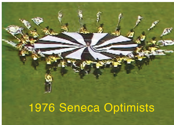
1976 Seneca Optimists

His creative show design skills, as well as his adjudication abilities have been well recognized. He earned the honor of becoming a member of the D.C.I. Hall of Fame, Class of 1999.