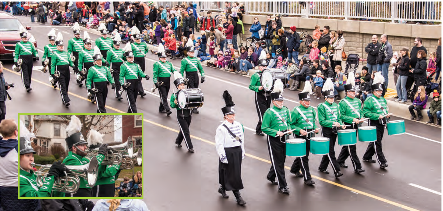
Thanks to the mild temperatures in Guelph the corps actually enjoyed playing their holiday parade repertoire.