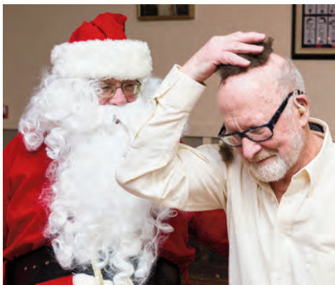
"It's a fuzzy brush? No, wait... is it hair?"