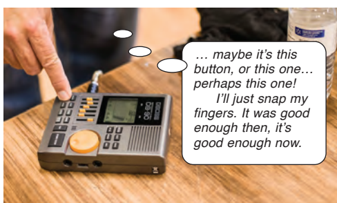
The metronome is an essential part of any rehearsal, especially for the “over 39” members.