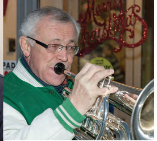
Warming up just outside the front door... so far, so good. However the sour pickle tongue didn't work as well as he'd hoped.