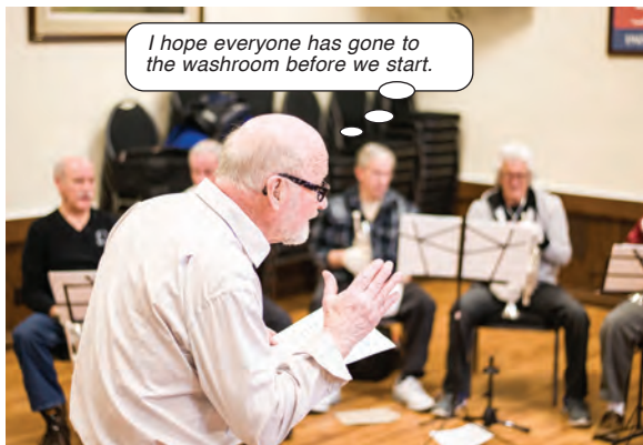
Allways looking on the bright side.