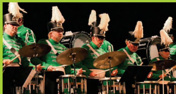
Optimists Alumni performing in 2012 at the "And The Bands Played On - 8". The show is hosted by the Simcoe United Alumni Drum and Bugle Corps.