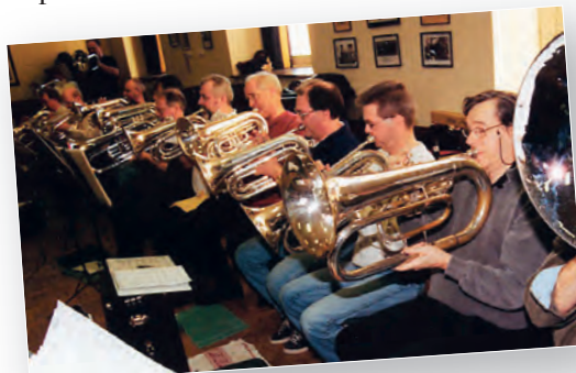
2003 rehearsal at the Legion.

As the season progressed we learned some of the tunes that the corps played in the early 60's; for people that had not played in 40 plus years, a relatively aggressive undertaking. However, we persevered and were able to pull it off by the first performance, in Optimist Style, even though I was very concerned and nervous. Looking back we did quite well and should be proud of ourselves. 🟢