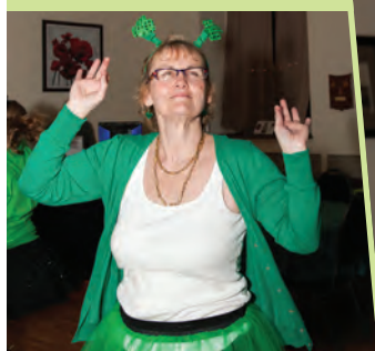
"More champagne, why thank you."