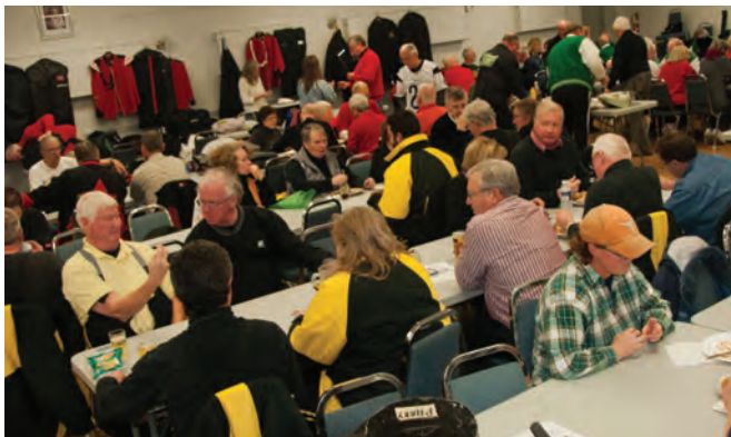
The Fenelon Falls Legion was host to The Optimists Alumni, The Signals Band and The Kawartha Cavaliers.

and... Fenelon Falls Every year we have done this parade the Legion has provided us with a place to meet, and good hot meal. Thank you for your hospitality.