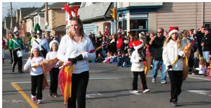
Part of The Northstar Junior Guard in the Guelph Christmas parade.

Thanks to those of you who suggested tunes to myself and the committee. The process of choosing songs is, to say the least, challenging. There are many things to consider. Rest assured, there was MUCH discussion and consideration before the final decisions were made. This show has a good mix of tunes which will allow us to perfect and create new sounds for our audiences.