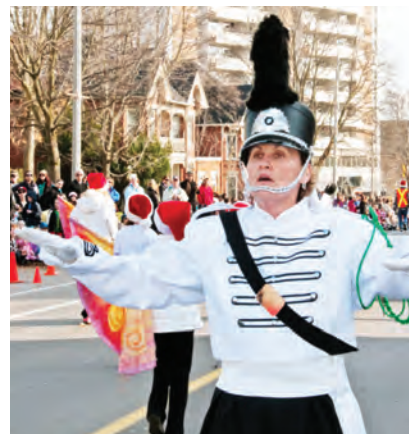
"I'm not sure there's a Tim Horton's at the end of the parade".