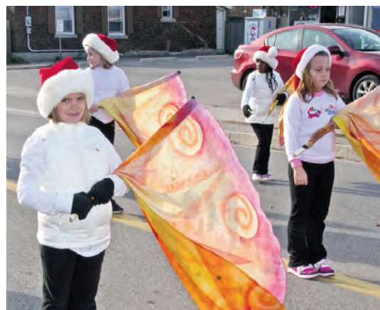
A wonderful addition to the Alumni Corps were the Nothstar Junior Guard.