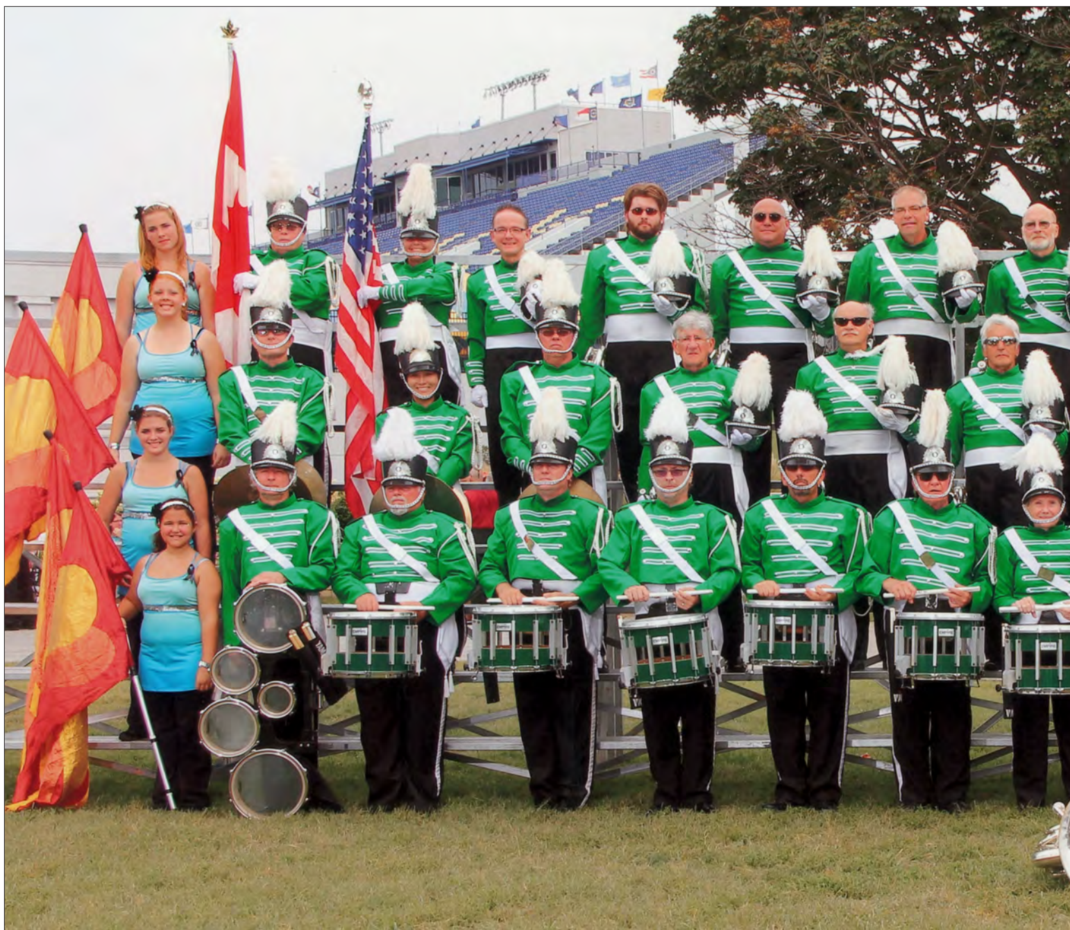
Optimists Alumni at the 2012 DCA Alumni Spectacular held in Annapolis, Maryland.