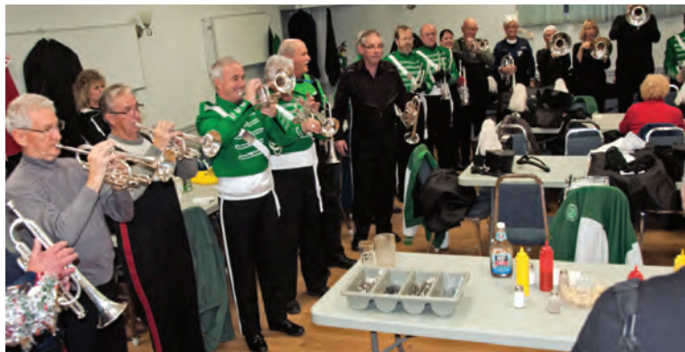
Warm-up for all corps before the parade. Everyone wished the "warm" part would last through the parade.