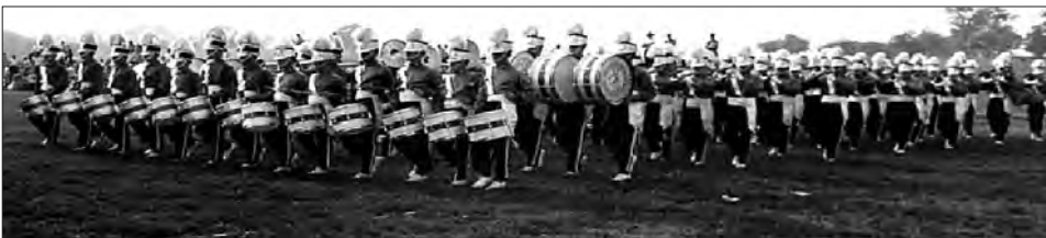
The Chicago Cavaliers (left) and Toronto Optimists on Retreat at Mundelein, IL., 1963

To celebrate the 50th anniversary it will feature nine corps in competition and two in exhibition. The participating corps have a combined 18 world championships and 43 national championships. Competing will be the Cavaliers, Rosemont, Ill.; The Cadets, Allentown, Pa.; Madison Scouts, Madison, Wis.; Glassmen, Toledo, Ohio; Colts, Dubuque, Iowa; Teal Sound, Jacksonville, Fla.; Legends, Kalamazoo, Mich.; Colt Cadets, Dubuque, Iowa; and Blue Saints, Sudbury, Ontario, Canada. The Optimists will be appearing in a pre-show entitled 'A Look Back through the Years' along with the Classic Cavaliers Alumni Drum & Bugle Corps from Rosemont, IL.