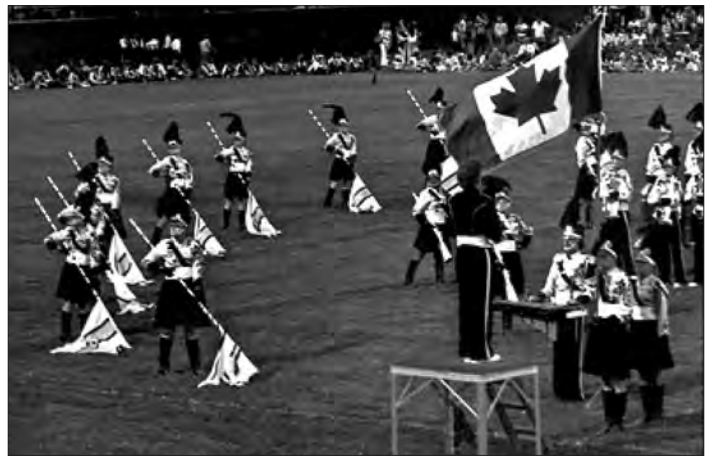
Seneca Optimist 1976 – Pageant of Drums – Michigan City, IN