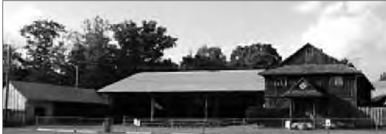
Auberge Richelieu in Welland, Ontario

The corps brought their road show to Welland as part of an ongoing mission to revitalize drum corps activity in southern Ontario.