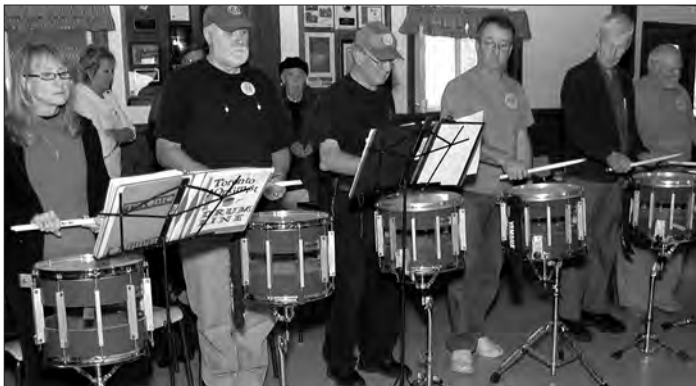
The drum line during ensemble at Welland.