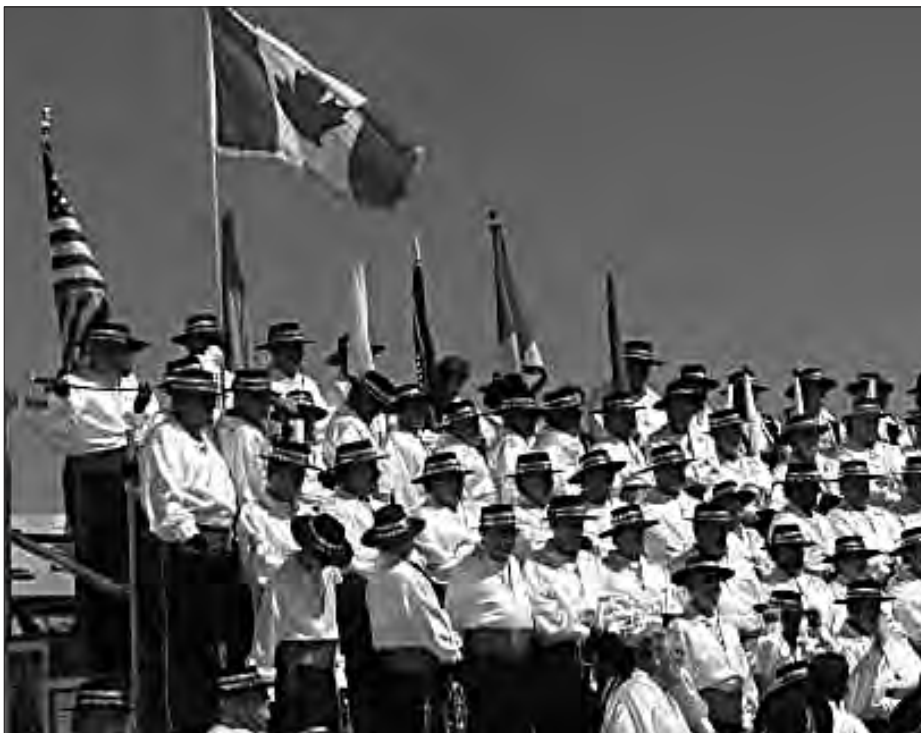
Hawthorne Caballeros having a photo taken at The DCI Alumni Spectacular in Rochester, 2008.

O N OCCASION, as the director of the Hawthorne Caballeros Alumni Drum & Bugle Corps, I am asked what makes the corps the success it has long since become. That is a difficult question to answer because there are so many reasons. We started out very humbly in 1994 with 18 horns, a small percussion section and almost no guard – but they were all former Caballeros. Contrary to what you might think, we were not a welcome addition to the